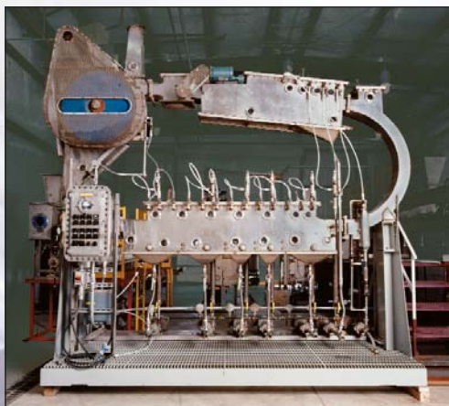
Model II Loop Extractor