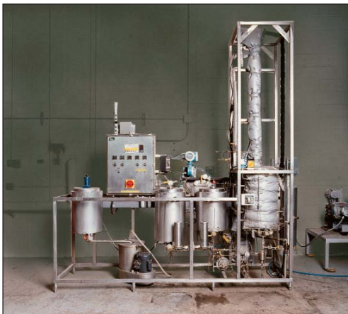
RBD Pilot Plant

Special design for desolventizing edible white flake, also suitable for drying or heating of foods and grains, polymers, and minerals with low speed agitation, to minimize breakage.