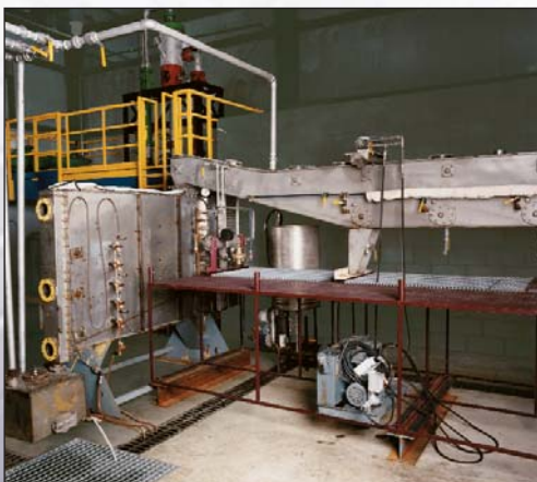
Model IV Immersion Extractor with DDD

Percolation type counter-current extractor for flakes and good draining materials.