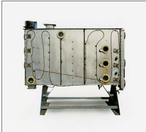
Down Draft Desolventizer (DDD)