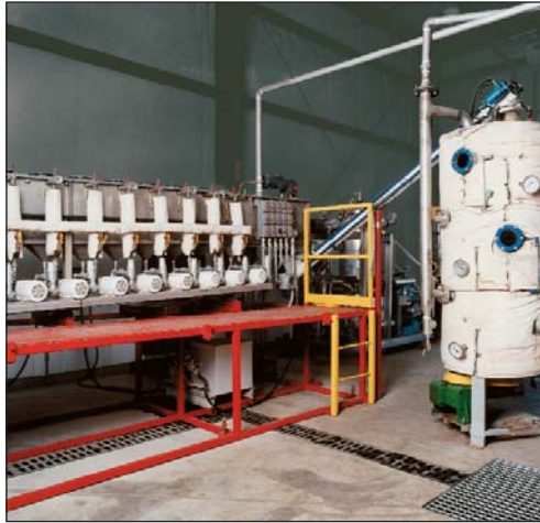
Model V Extractor with Desolventizer-Toaster