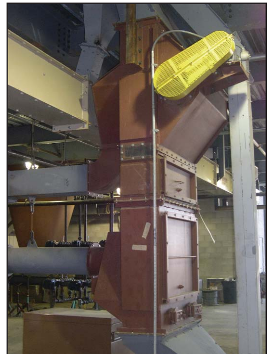
Crown Closed Loop Aspiration System.