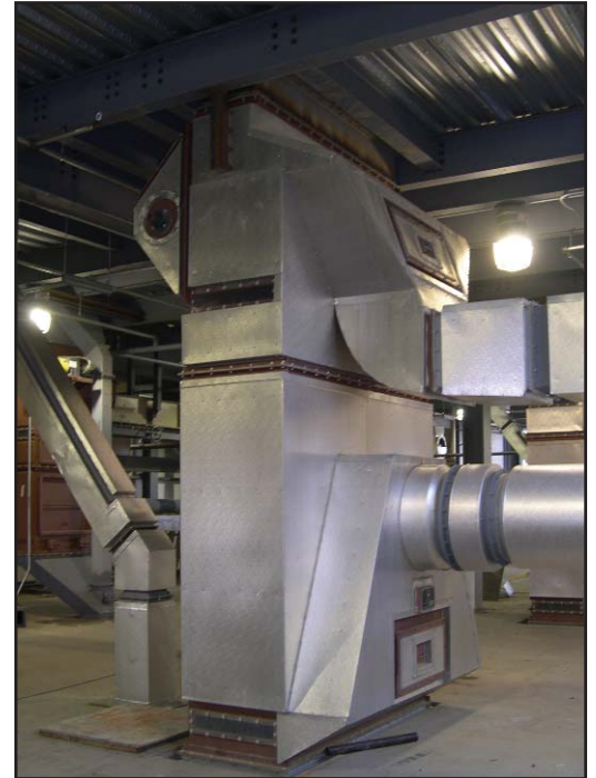
Crown Cascade Aspirator

The heavy duty feeder is designed to evenly and consistently spread the product across the entire width of the machine. The unit is designed to be choke fed, and when equipped with an optional level control and variable speed drive, provides a completely automatic feeding system.